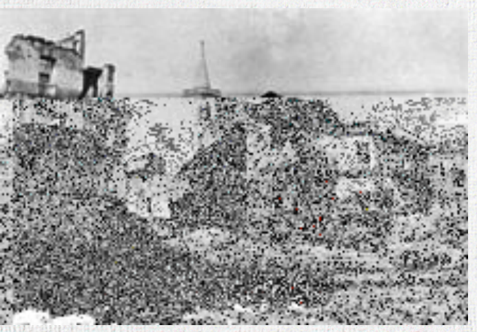
Left: Piazza Marina Right: Licej Svetog Dimitrija.

The first major air attack of Allies on Zadar was in the night of 2 November 1943, when the Home for orphan children was destroyed, among other objects, and there followed great attacks on 28 November (over 200 victims) and 16 and 30 December 1943. First attacks were marked by large number of civilian casualties, but the city, though damaged, continued to function. Particularly difficult bombing was on 16 December, when shelters on Cererija (present Vostarnica) were hit, and those in the center of town. That time some 150-200 people got killed. 50 American bombers 'Mitchell' (B-25) participated in that action, throwing 90 tons of bombs.